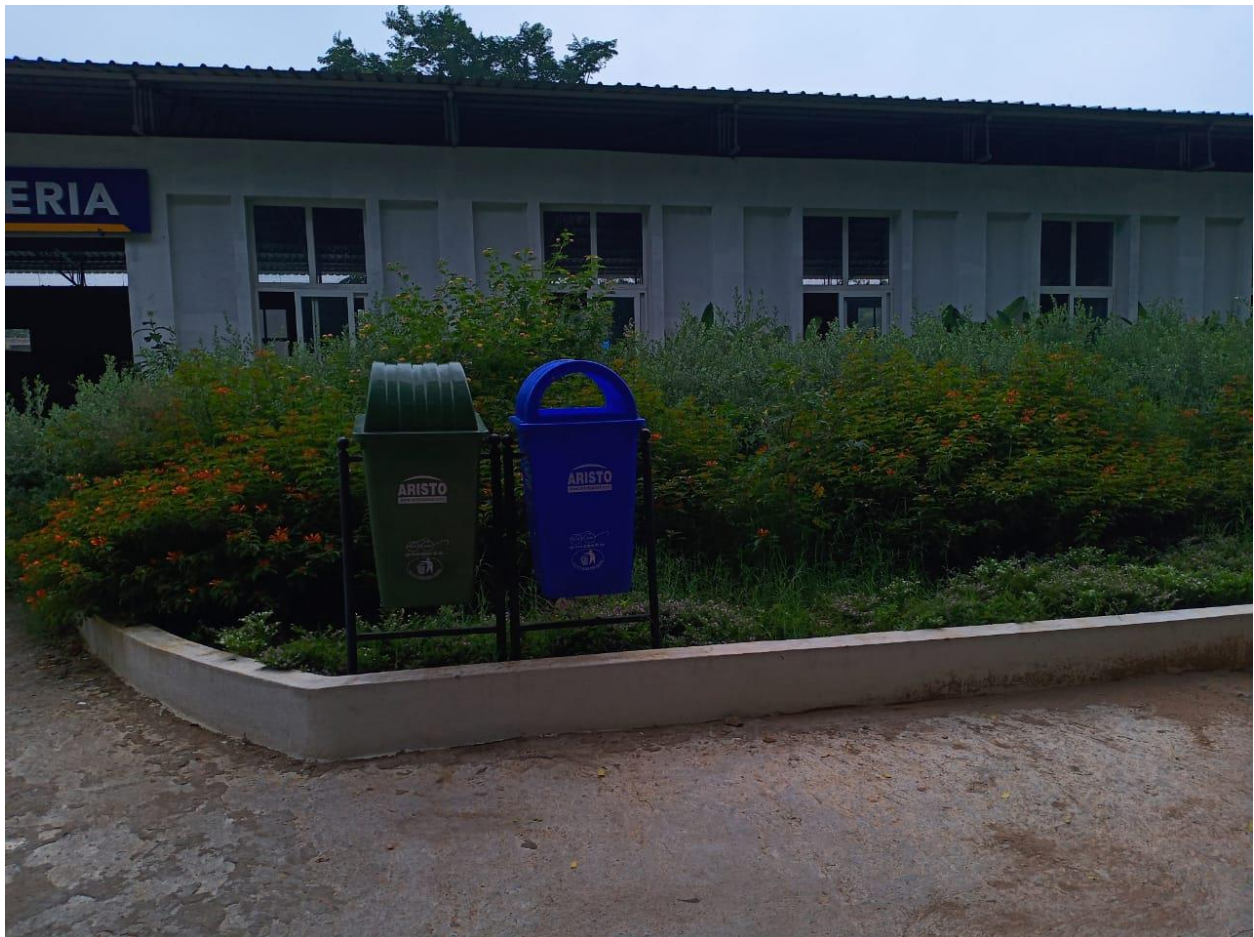
DUST BINS FOR PROPER DISPOSAL OF SOLID WASTE AT AVNIET

Solid waste management in college campus is done in a systematic way ,Dust bins are provided in the whole college including the wash rooms and laboratories also, The cleaning staff collects the waste in the morning and evening at regular basis and dumped into the dumping yards at the regular basis and properly disposed.