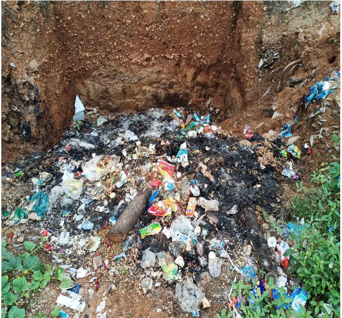
COMPOST PIT IN THE COLLEGE FOR SOLID WASTE MANAGEMENT