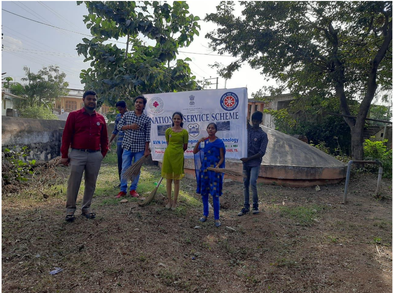
SWATCH BHARAT PROGRAMME AT BRAHAMANPALLY ZPHS SCHOOL