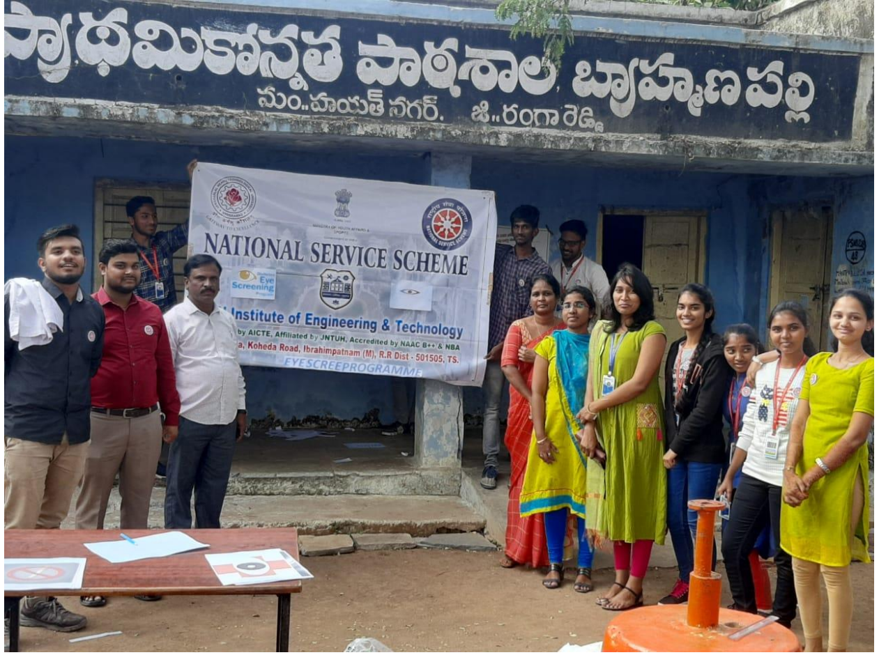
CLEANLINESS PROGRAMME AT BRAHAMANPALLY VILLAGE